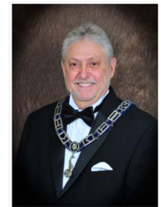
Glenn Miller